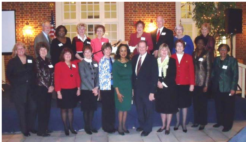
PAST PRESIDENTS HRCA 60 TH ANNIVERSARY REGENT UNIVERSITY