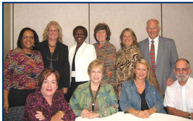
2008-2009 HRCA Executive Board