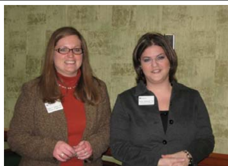
Virginia Wesleyan photos