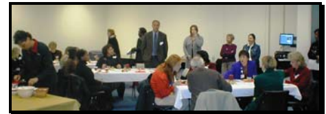
Members enjoy fine holiday desserts at the Regent University meeting