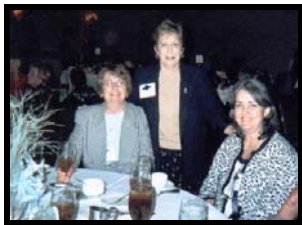
VCA Large Chapter of the Year HRCA!