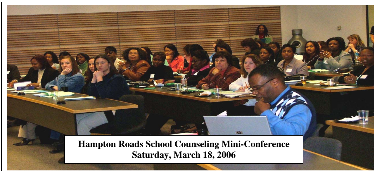
Hampton Roads School Counseling Mini-Conference Saturday, March 18, 2006