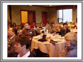
HRCA Members attend Professional Development General Membership meeting at VWC in February