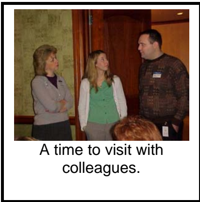
A time to visit with colleagues.