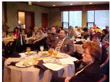
The lunch was superb!