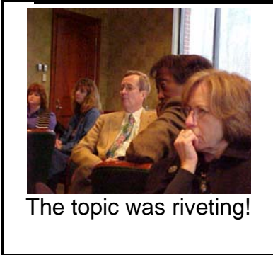
The topic was riveting!