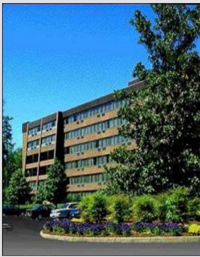
Williamsburg Marriott Convention Center